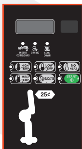
Quantum™ Gold Control