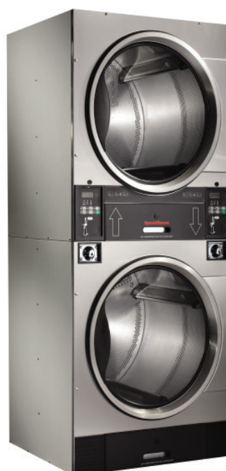
Stainless Steel Front